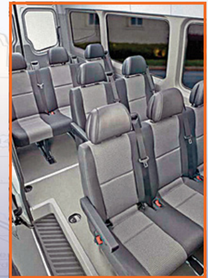
▲ Typical seating configuration of our Mercedes Sprinters.

Schedules and fares are subject to change and reservations are always required.